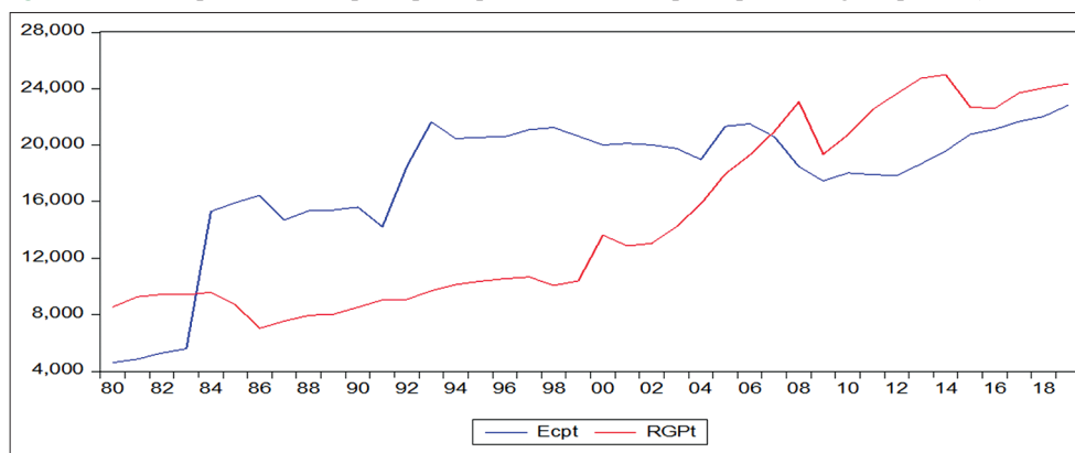
Figure 1: Electric power consumption per capita and real GDP per capita during the period (1980-2019)